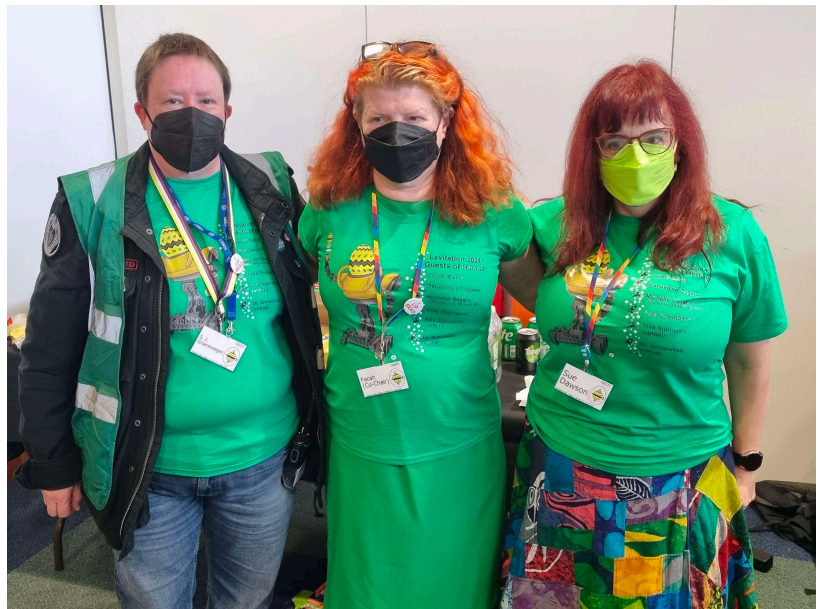
Stylish trendsetters spotted dressed up and looking amazing

It's official: tech have been in to monitor and can confirm that the Green Room is full of hot air.