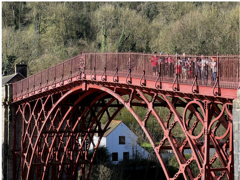
The fans at Bridgecon

18 intrepid Levitation members braved the morning fog today to walk through the town park and down to Ironbridge, the birthplace of the Industrial Revolution. We set out at 7am, passing some industrial archaeology and the scene of a mining disaster before arriving at the Iron Bridge itself two hours and five miles later, just in time for a lovely breakfast at Truffles café, recommended. The fog cleared en route, and by the time we arrived the sun was shining.